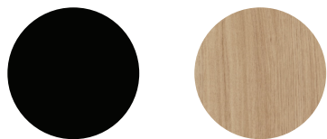
Stained Black Natrual Ash

We also offer a wider range of finishes. Please consult your current pricelist or a member of our Sales team for further details.